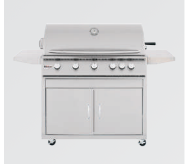
SUMMERSET SIZZLER CART