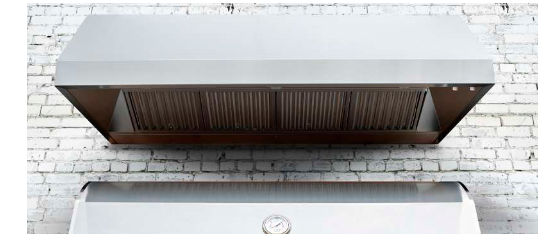
VENT HOOD (36", 48", 60")