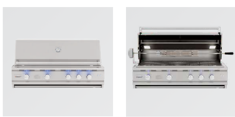
32", 38", TRL / 44" TRLD